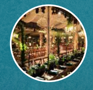
THE GLASS MARQUEE